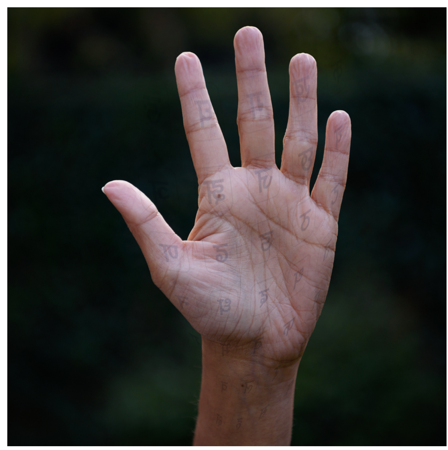
Indelible, from the series Generation 1.75 Winter Solstice Show The Griffin Museum Winchester, Massachusetts 12/10/19-1/3/20