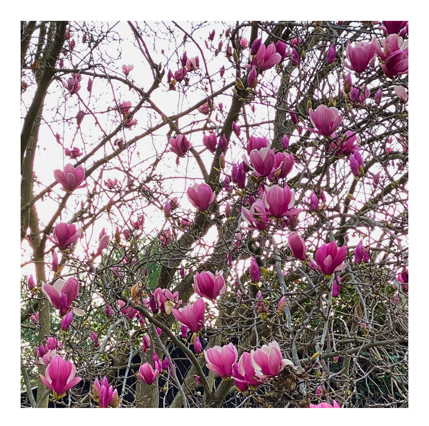
I went for a walk today and gathered the fallen pink magnolia petals, like poems for my pocket ... a gentle reminder that even amongst the bare branches and sorrow there is beauty and a life-affirming intoxication. Wishing you much love for 2021.

JOIN ME ON ZOOM: Tuesday, February 16th 5pm PST